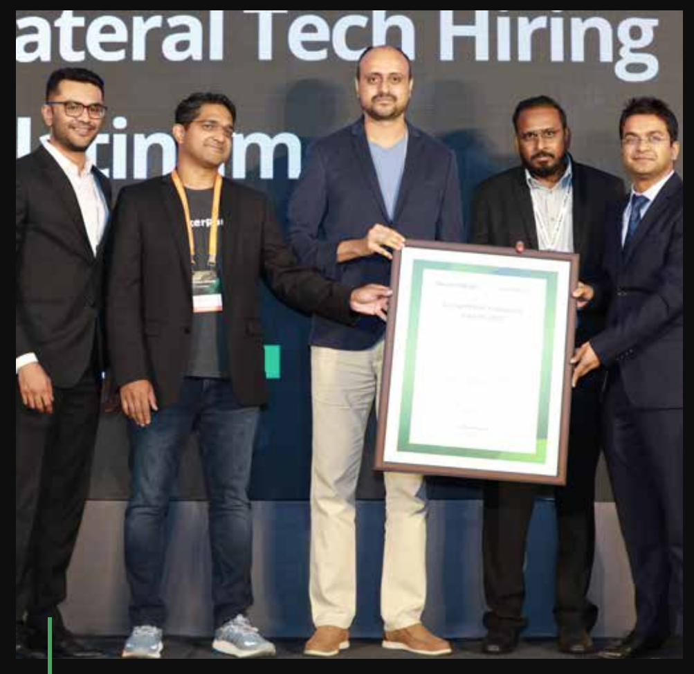
Platinum Winner: Goldman Sachs

Recognized trailblazers for their outstanding commitment to hiring lateral talent and delivering exceptional candidate experiences at scale