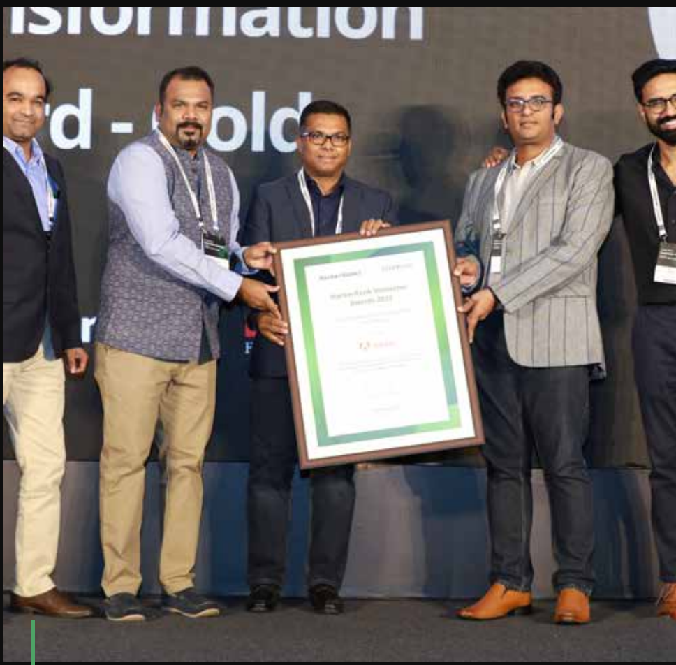
Gold Winner: Adobe