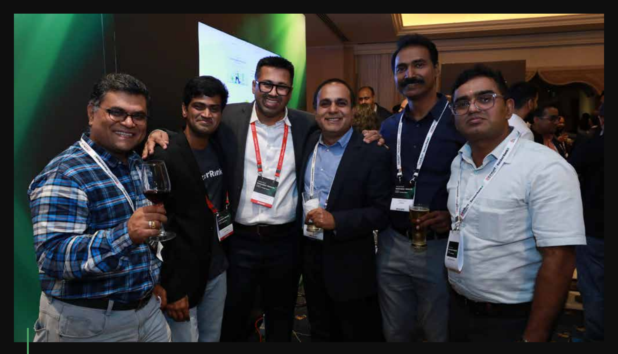
A dynamic bunch of 370+ professionals and executives, united in a shared pursuit of knowledge and collaboration.