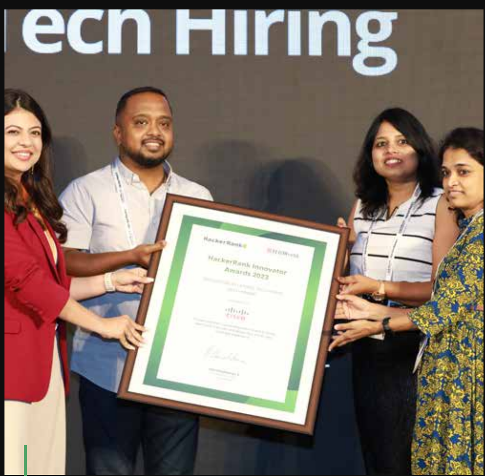
Gold Winner: Cisco